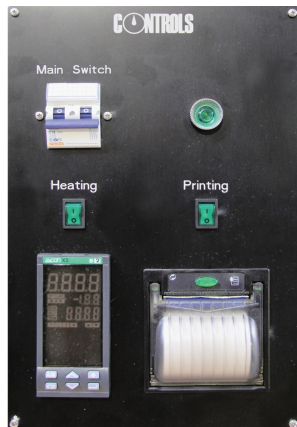
Programmable accelerated curing tank, detail of control panel