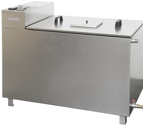
Programmable accelerated curing tank 55-C0194/D, 55-C0194/DV, 55-C0194/E