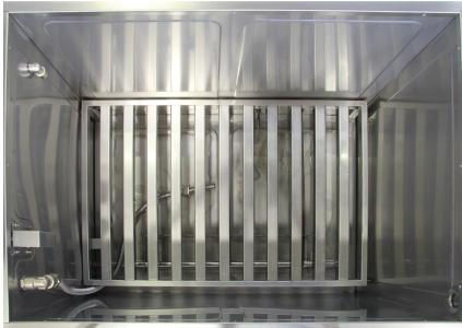
Programmable accelerated curing tank, detail of base supporting grid